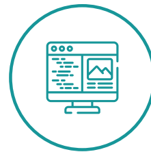
Logos and Banners